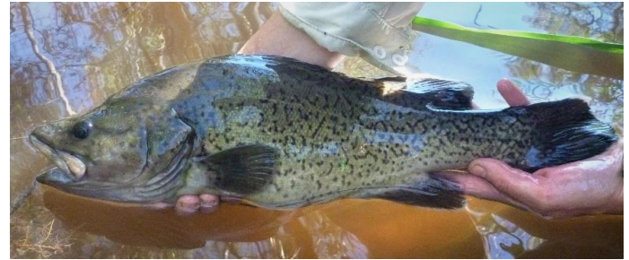
Figure 4. Trout cod

Above Gooram Falls (Reach 2) there was a 60% increase in Trout cod numbers, with 46 captured, including 31 at one site. Of the total number of Trout cod captured 37% of these were young-of-year, indicating good recruitment in 2019.